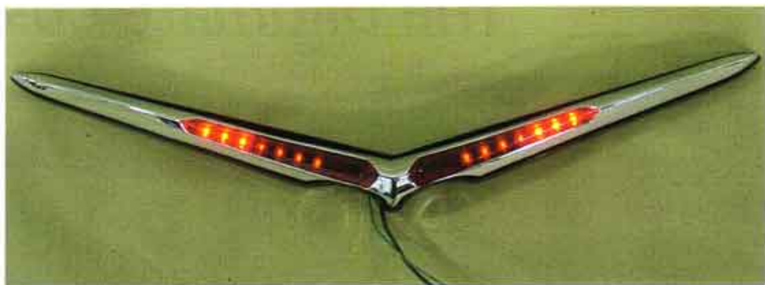
Photo #8: For the 1957-style V, when the running lamps are on the top three LED lamps are fully illuminated while three of the lower LED lamps are on at 50 percent brightness.