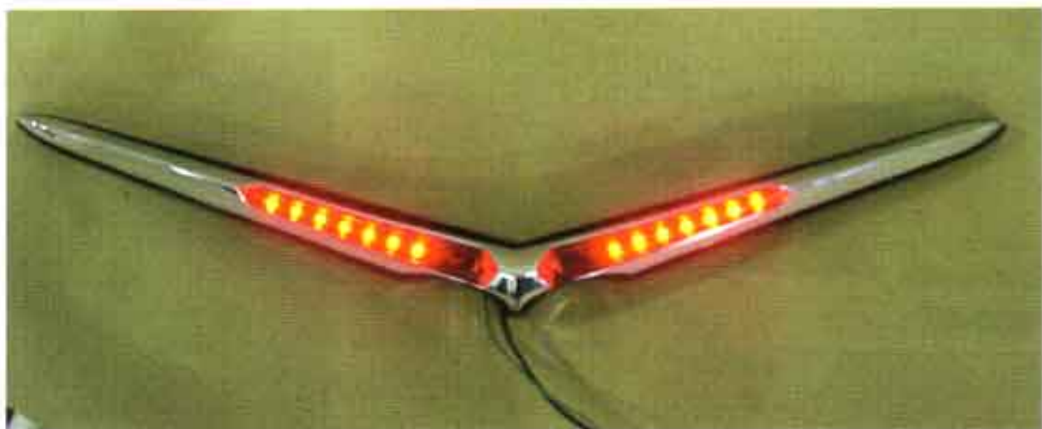
Photo #9: When the brake lamps are on, all seven LED lamps will fully illuminate. This will really light up the back of your car!

With a set of LED taillamps and an LED third brake lamp, no one will have a problem seeing you day or night. And it looks cool too! Good Luck!