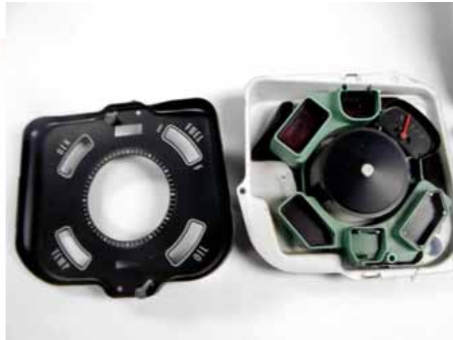
Take the Face off the cluster