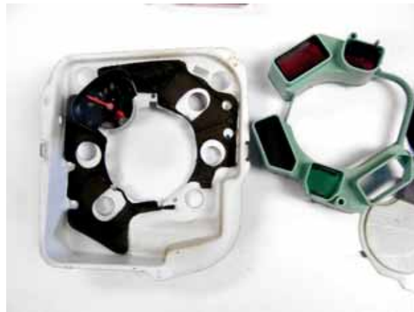
and idiot light cluster