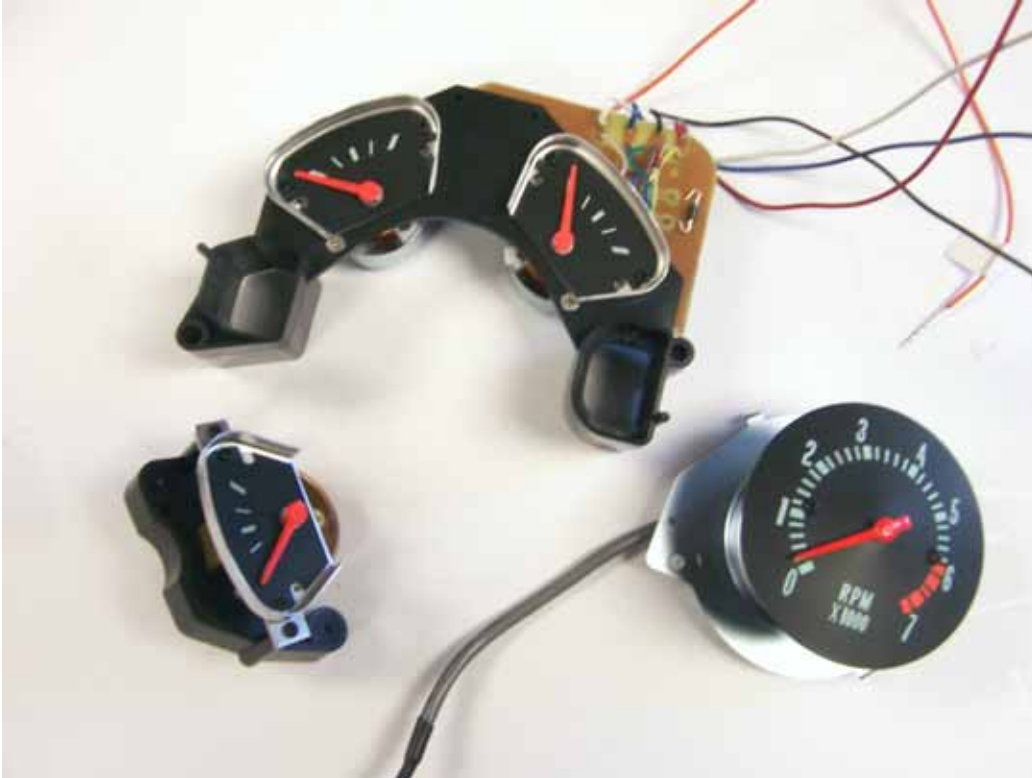
Gauges kit and Tachometer kit

NOTE: Photos are of Pre-production prototypes. Final product will be different.