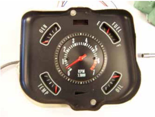
Front of new cluster