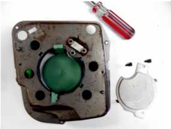
Remove blank or clock